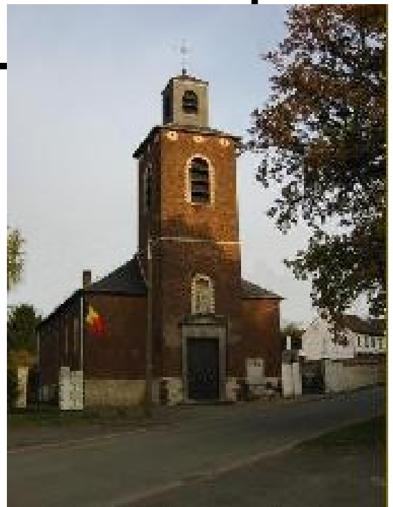
Saint Martin de Dion-le-Val, Belgium

Dion might have been named after the Celtic word devonos , divine, holy. in Latin, the toponyms Devona and Divona refer to holy rivers, and Dion might have been named after a holy fountain or source. Dion, made of the two villages of Dion-le-Mont and Dion-le-Val, is located on a large limestone strip stretching from Givet to Beauraing; limestone is there rich in iron lodes, which have been exploited since the Roman times.