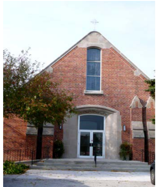
Chapel of Our Lady of Good Help - Robinsonville, WI

By the end of the 1930's, it had become clear that, again, the Chapel was too old and small to handle the increasing numbers of pilgrims making their way to the Shrine. Father Smits appealed to Bishop Rhode that if people saw some evidence of the initiation of a building program, Our Lady would see to it that the funds would come. So the Bishop started plans for the building of an updated Chapel, bountiful contributions came in, and Father Smits' assurance of help from Our Lady was confirmed! A new, larger red brick Tudor Gothic chapel seating 300, with its 47 foot by 118 foot main section and a 47-foot wing flanking one side of the sanctuary, was completed in May and dedicated in July of 1942. Today, the Chapel is under the guardianship of the Diocese of Green Bay.