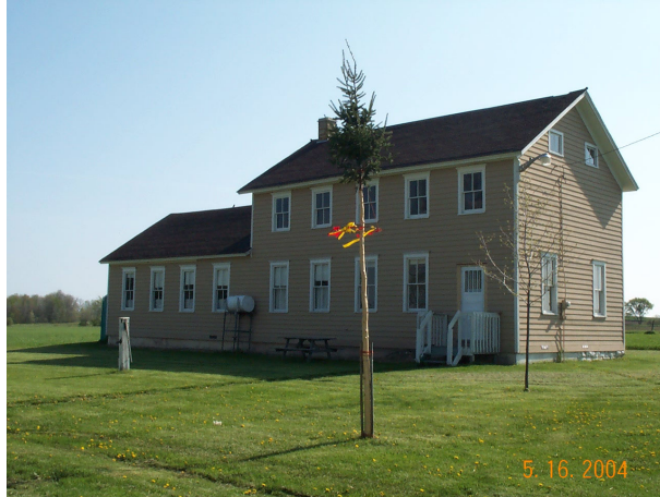
↑ Namur, WI 2004

May Day is celebrated around the world. It is a festival of happiness, joy and the coming of summer.