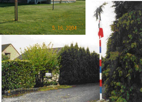
→ Grez Doiceau, Belgium 2004

The Wallonie-Wisconsin Club held their May Pole celebration in Grez-Doiceau.