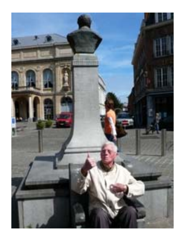
In Memory of

to everyone at Netradyle for their contributions and for making these records available to the public, without asking for anything in return